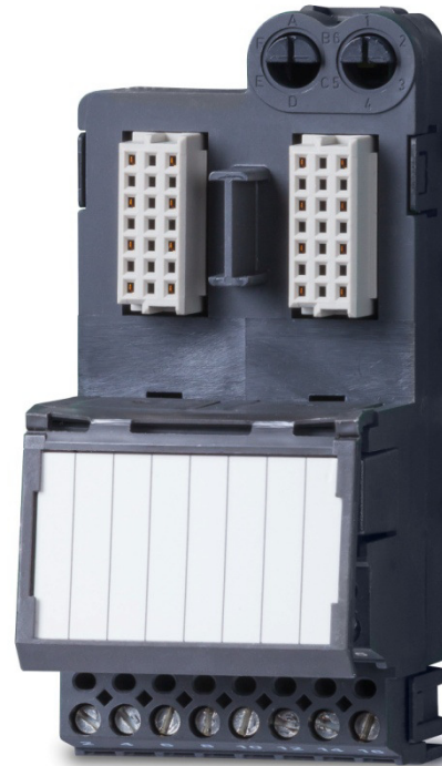
Traditional I/O terminal block.

Phased installation saves time. As soon as you mount the I/O interface carrier, you're ready to begin installing the field devices. I/O terminal blocks plug directly onto the I/O interface carrier. There is no need to have the I/O cards installed.